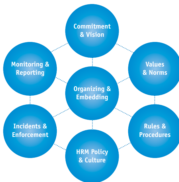
Figure 1 Integrity Infrastructure