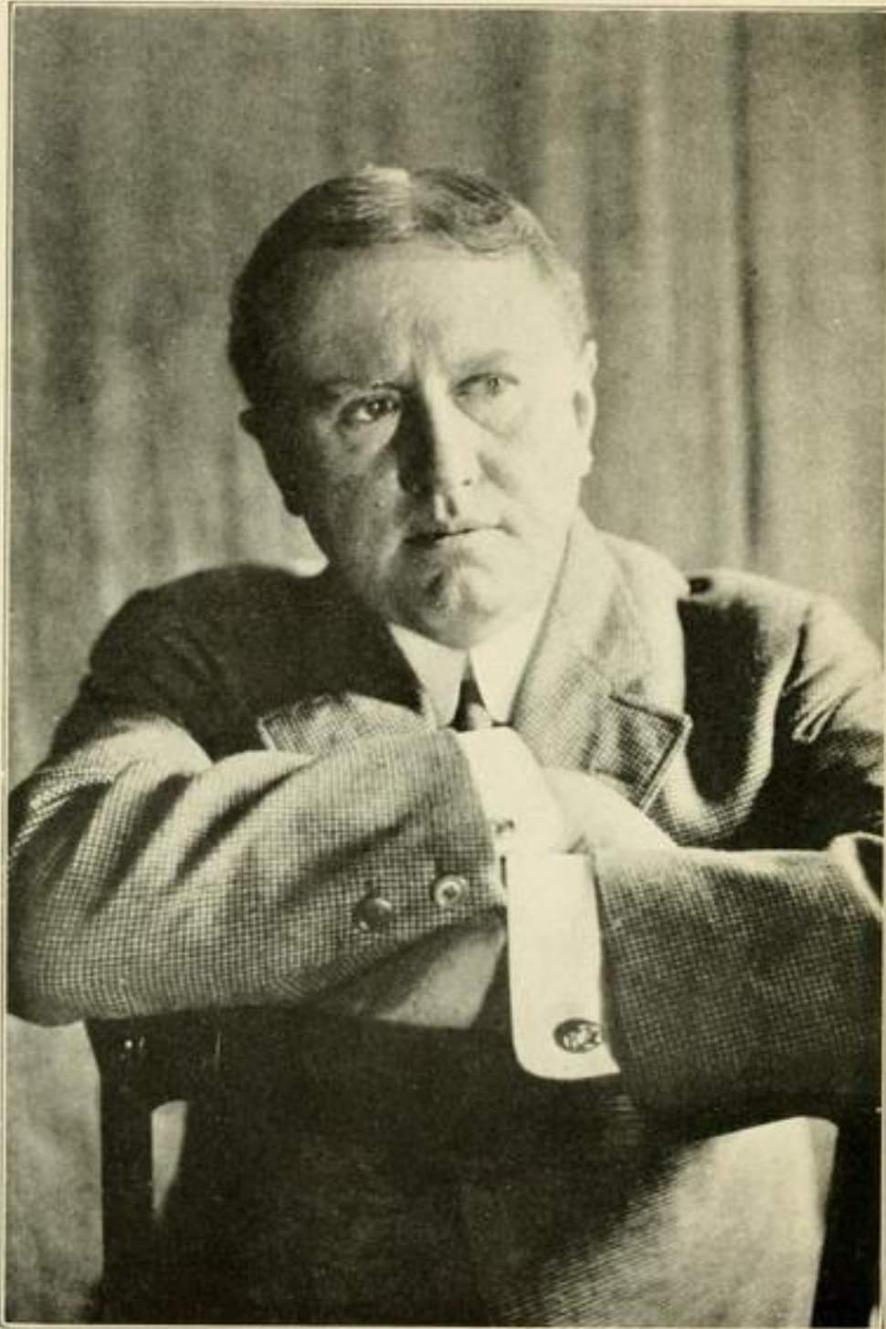
O. HENRY IN THE WINTER OF 1909-10