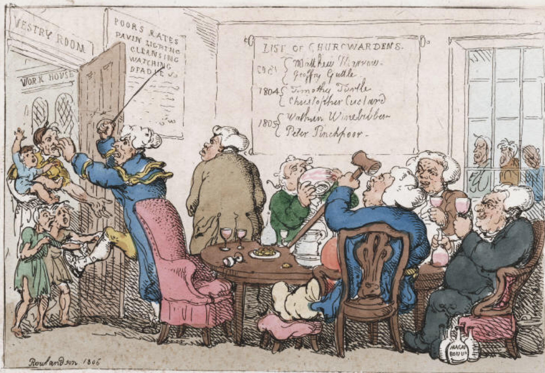
A SELECT VESTRY