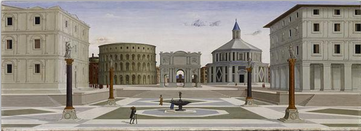
"The Ideal City" of the Renaissance by Fra Carnevale.

Cities generally have complex systems for sanitation, utilities, land usage, housing, and transportation.