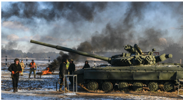
Ukrainian servicemen attend military training in Chernihiv, Ukraine, on November 28, 2018.

violence in Mexico, an economic crisis and political instability in Venezuela, and deteriorating conditions in the Northern Triangle (El Salvador, Guatemala, and Honduras)—an unprecedented number compared to previous survey results.