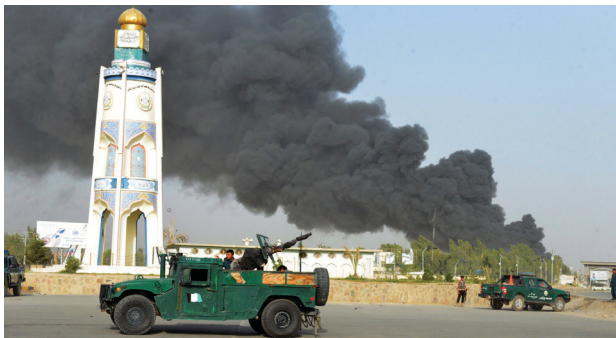
Afghan security forces arrive after a powerful explosion outside the provincial police headquarters in Kandahar, Afghanistan, on Thursday, July 18, 2019.