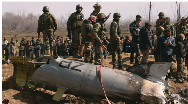
Indian soldiers stand next to the wreckage of an Indian Air Force helicopter after it crashed in the Budgam district of Kashmir, on February 27, 2019.