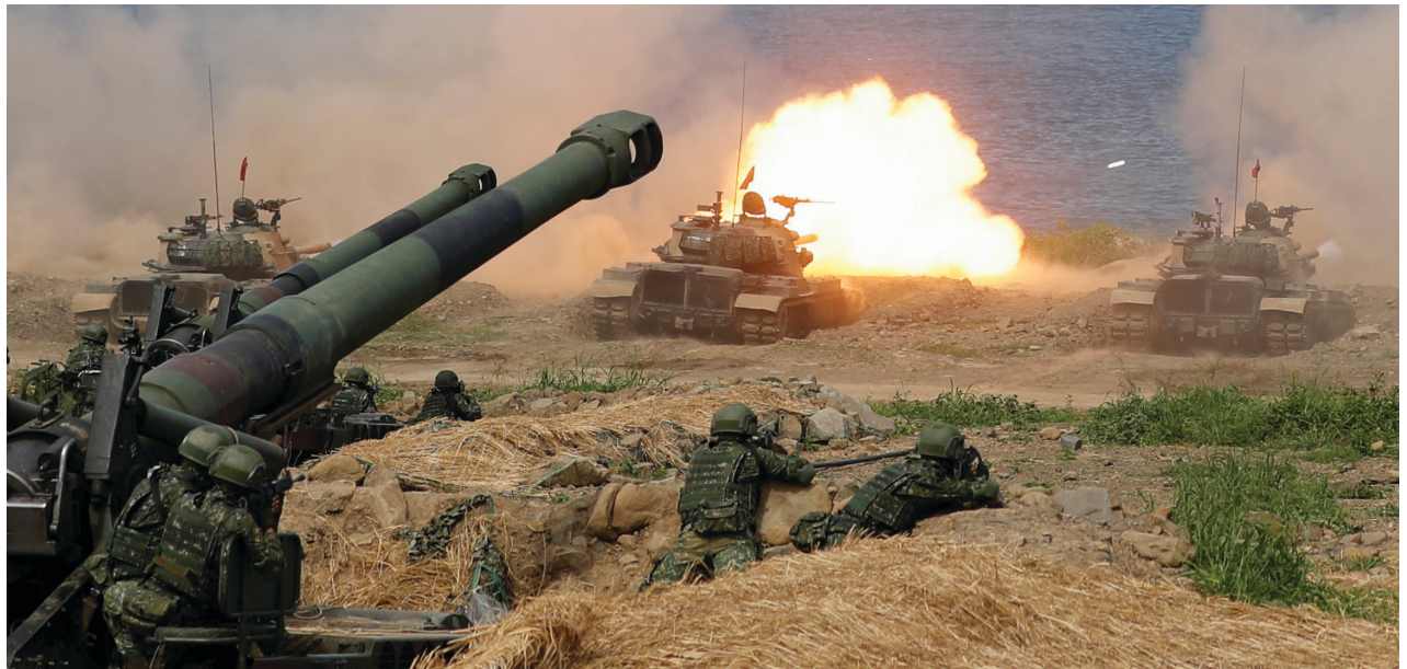
A CM-11 Brave Tiger tank fires during the Han Kuang live-fire exercises held by Republic of China Armed Forces in Pingtung, Taiwan, on May 30, 2019.

which sources of instability and conflict warrant the most concern. Each respondent is asked to assess the likelihood and potential impact on U.S. interests of thirty contingencies identified in an earlier public solicitation (see methodology, page 4). The results are then aggregated and the contingencies sorted into three tiers of relative priority for preventive action.