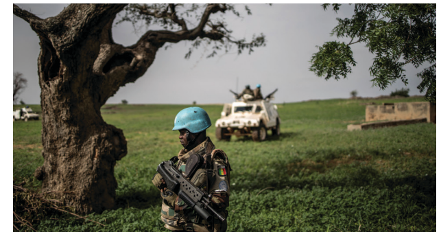
A UN peacekeeper in Mali patrols the destroyed Fulani village of Sadia Peulh, on July 5, 2019.