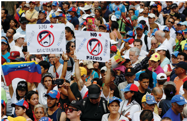
Protestors march against Venezuela's President Nicolas Maduro in Caracas, Venezuela, on November 16, 2019.

To help U.S. policymakers decide where to focus their attention, the Center for Preventive Action (CPA) at the Council on Foreign Relations has surveyed American foreign policy experts every year since 2008 to ascertain