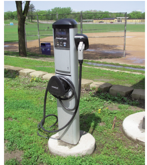
A solar-powered EV charging pump at McMurray Field

The city continues to monitor and evaluate this early EV infrastructure, and will use the information to weigh future investments against the market for EVs and the demand for charging stations. For now, the city is pleased with the improvements it has already made to its fleet and with the options it is now able to offer those who have made the switch to electric vehicles. There are hopes these projects will promote awareness and support of a more sustainable and healthy future for the residents of Saint Paul.