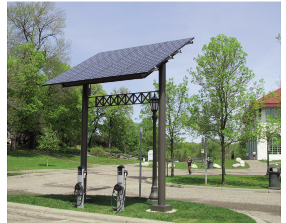
A solar-powered EV charging station at Como Regional Park

Two of these new solar-powered EV charging stations were installed at Saint Paul's Como Regional Park. Located at Como Lake Pavilion and McMurray Fields, they are the first of their kind in Minnesota. These sites were chosen because Como Park is a regional destination and a popular attraction for visitors who may be driving a fair distance. While the solar-powered units are popular for their use of renewable technology, they come at a substantially higher cost than electric-powered stations. The units installed at Como Park each cost $35,000, while electric-powered on-street charging stations were origi-