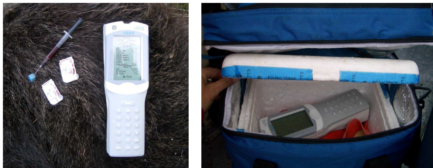
Figure 5. The i-STAT®1 analyser used for field analysis of arterial blood samples (left). Storage of the i-STAT®1 during fieldwork to ensure optimal temperature conditions (right).

Arterial samples were collected anaerobically by using self-filling arterial syringes with heparin (PICO™70, Radiometer Copenhagen, Brønshøj, Denmark) (Fig. 5). In carnivores, the femoral pulse was palpated in the groin and the needle was introduced percutaneously into the femoral artery, confirmed by pulsating blood. Firm pressure was applied to the sample site for 2 min post-sampling to avoid bleeding. In rhinoceros, samples were collected from the artery on the medial aspect of the ear (Fig. 4).