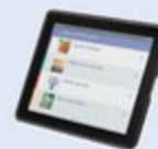
satnav/GPS [satellite navigation / Global Positioning System]