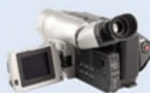
high-definition (HD) camcorder