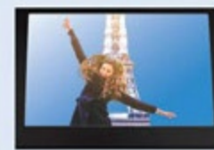
digital photo frame