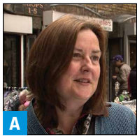
A Liz Y